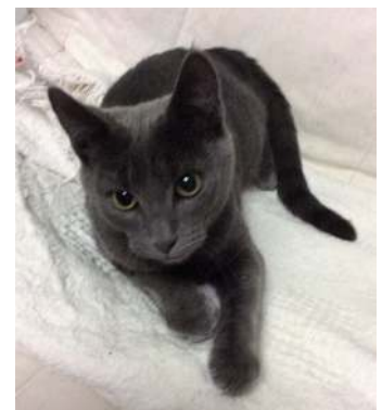
Melody the studio cat loves to greet students as they arrive, but she really just likes to laze around the studio.