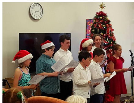
Finishing the performance with group singing of Christmas carols.