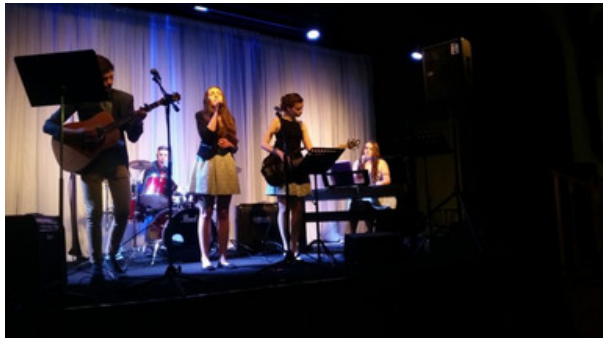
Pre-dinner entertainment by talented young musicians from Flinders College.